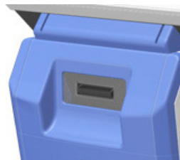
Magnetic Card Reader