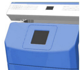
2D Barcode Reader