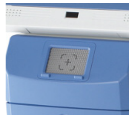
Contactless IC Card Reader/Writer